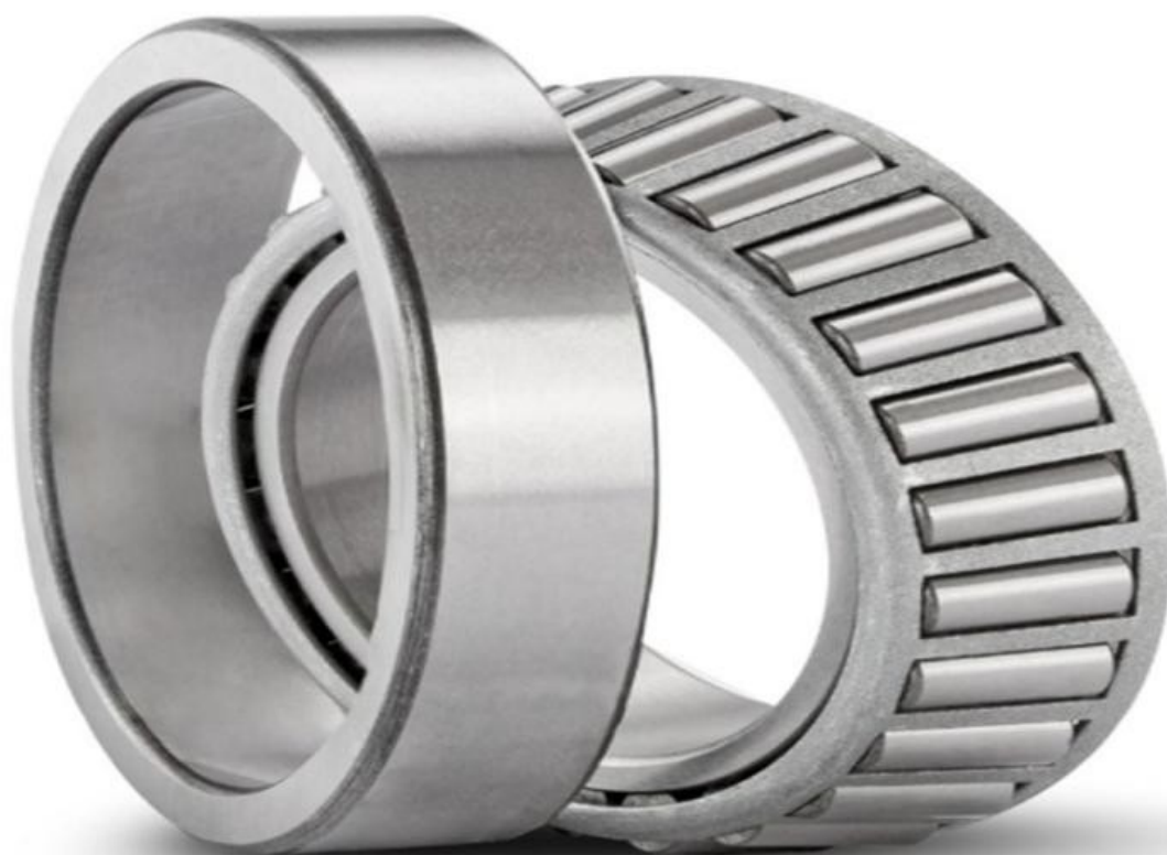
Tapered Roller Bearings – TSF (Tapered Single with Flange)

In summary, recent innovations in Tapered Roller Bearings - TSF have focused on enhancing performance, durability, and functionality through advanced materials, design optimization, and integration of sensor technology. Emerging trends such as predictive maintenance and smart capabilities are shaping the future of TSF bearings, enabling proactive maintenance and integration with Industry 4.0 systems. Predictions for the future evolution of TSF bearings include further advancements in sensor technology, lubrication techniques, and modular design concepts to meet evolving industry demands and applications.