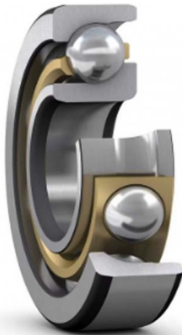
Angular Contact Ball Bearings

Definition and Significance of ACBBs: Angular Contact Ball Bearings (ACBBs) are specialized bearings designed to accommodate combined radial and axial loads. Their unique angular contact design allows for high-speed operation and precise load distribution, making them indispensable in applications requiring high performance and reliability.